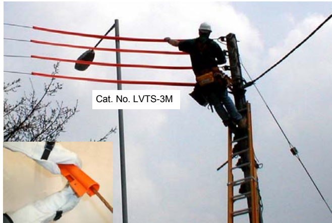
Cat. No. LVTS-3M

Bright orange colour keeps workers visually aware of the proximity of live conductors and helps in locating shrouding for recovery when jobs are complete. Supplied in 3 metre lengths with a 25mm internal diameter the shrouding is designed with cutouts at each end so that it can be easily opened and fed onto the conductor when wearing gloves. A connector is available for joining lengths of shrouding together. Manufactured from black rubber, the connector is folded over the shrouding and secured with plastic cable ties.