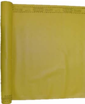
Class 0 Cat. No. EL-0-25 Class 1 Cat. No. EL-1-25

Manufactured in the USA to conform with OSHA regulations for personal protective equipment Rubber Shielding is available in two classes - Class 0 (Yellow) with a maximum working voltage of 1kV and Class 1 (Yellow/Orange) with a maximum working voltage of 7.5kV. Provided in rolls 3ft wide by 25ft long the Rubber Shielding can be easily cut to suit any application. Ideal for providing protection against electrical apparatus such as relays, batteries or switch boards. Insulating shielding can also be supplied in pre-cut sizes with sewn on velcro edging.