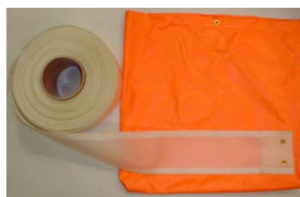
Conductor Shroud - 25 Metre Roll

Tel: 01275 342700/Fax: 01275 349009 E-mail: enquiries@hor-i-zon.com