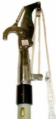
PRU020 Tree Lopping Head. 1 3/4" (44mm) dia. cutting capacity. Centre cut.

For tree clearing near overhead power lines we offer two Tree Pruning Heads and a Pruning Saw. The Pruning Heads come complete with 2 metres of plastic chain to act as a rope insulator. A sample of the plastic chain has been tested at 75kV per foot. All accessories are designed to fit the top section of our Operating Rods and can easily be adapted for use with our Telescopic Operating Rod.