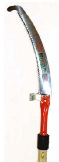
SANDVIK-1 Pruning Saw cuts on the push and pull stroke. 14" (355mm) Blade.

Tel: 01275 342700/Fax: 01275 349009 E-mail: enquiries@hor-i-zon.com