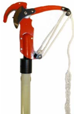
PRU010 Sandvik Tree Lopping Head. 1 3/4" (44mm) dia. cutting capacity. Side cut.